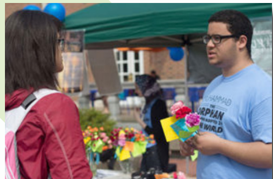
Muslim American Society promotes faith awareness